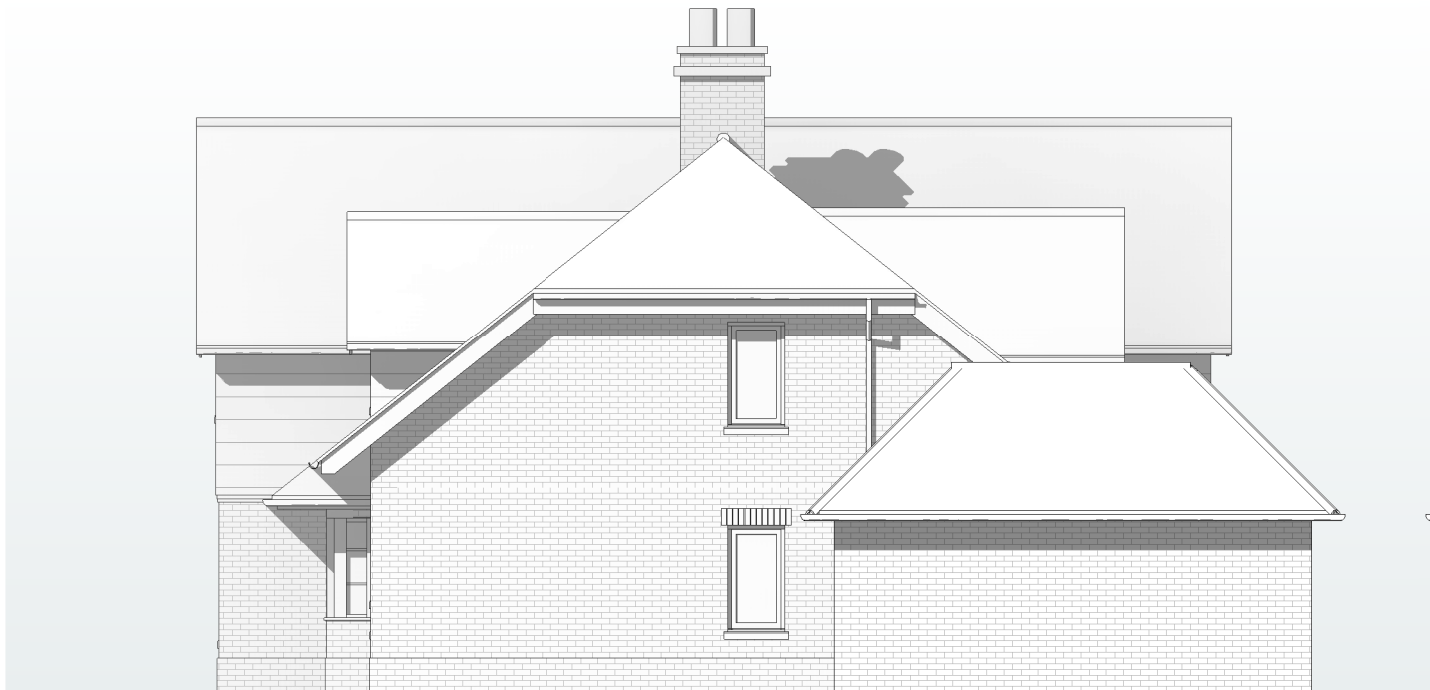
PLOT 2 Side - South East Elevation