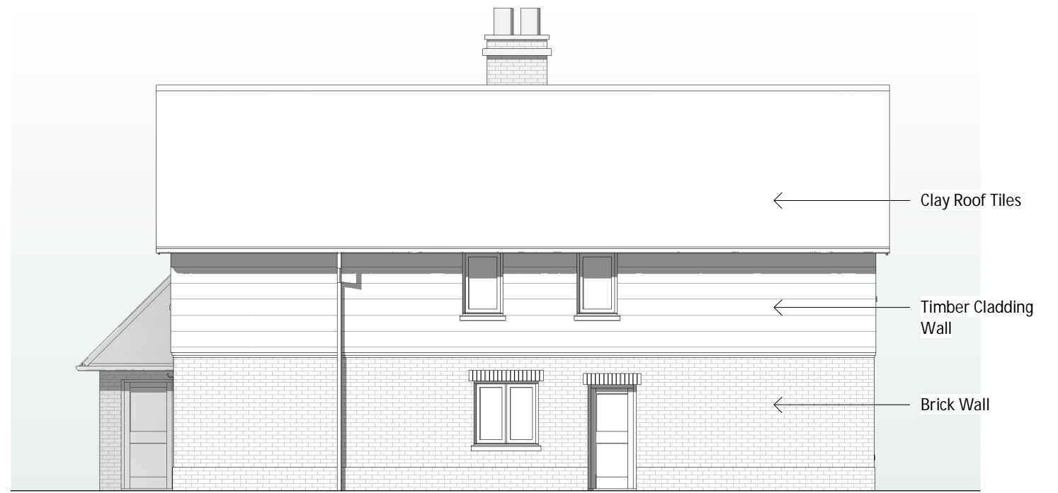
PLOT 2 Side - North West Elevation