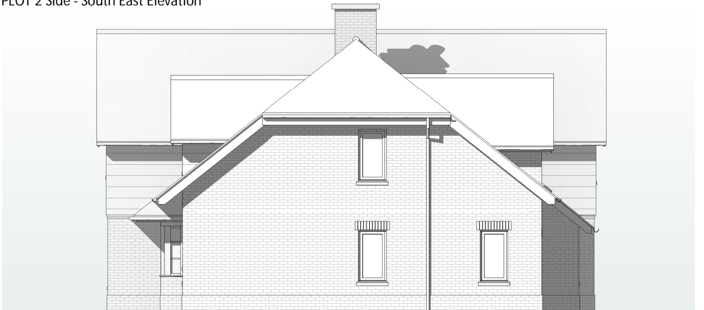
PLOT 2 Side - South East Elevation - without Garage