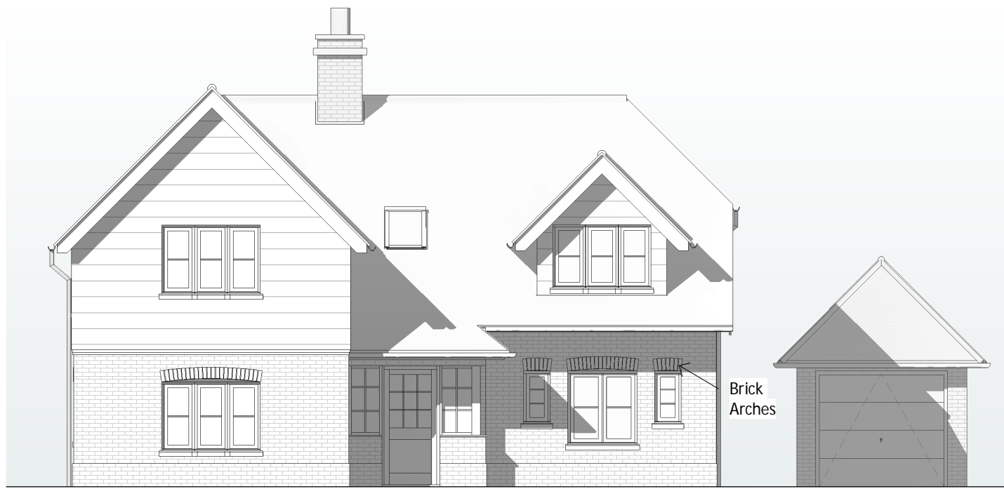
PLOT 2 Front - South West Elevation