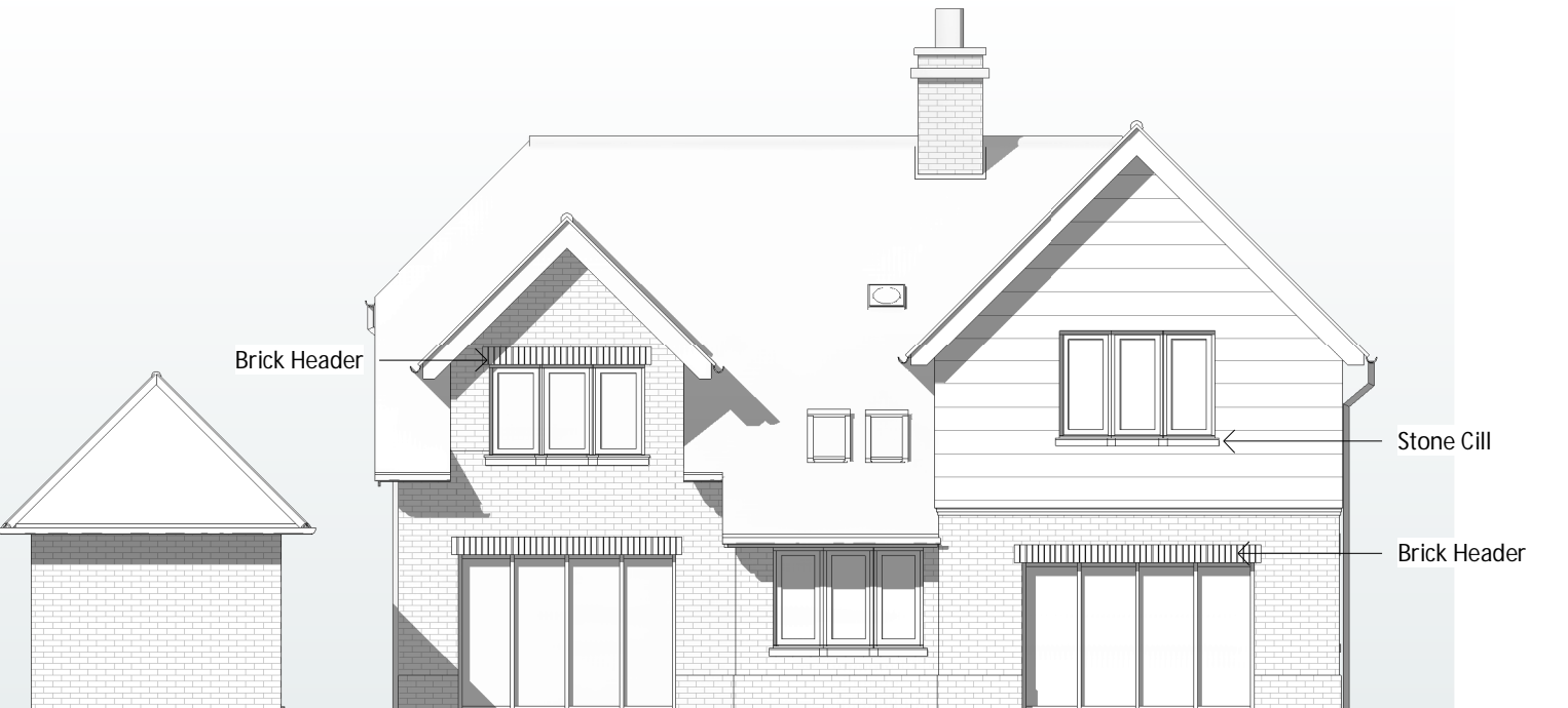
PLOT 2 Rear - North East Elevation