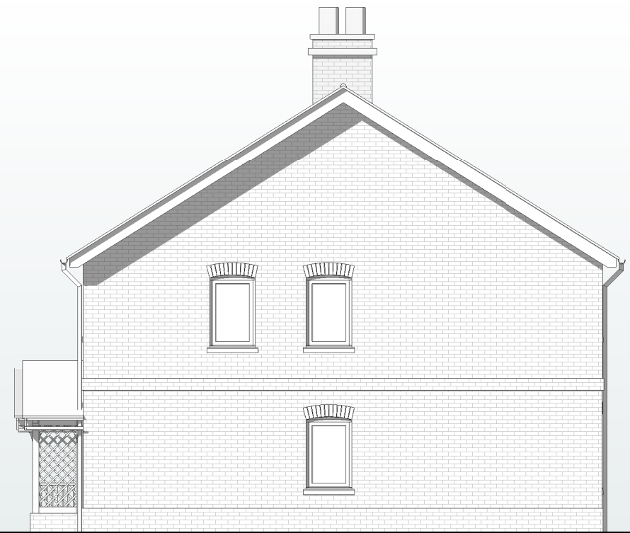
PLOT 6-7 Side - North East Elevation