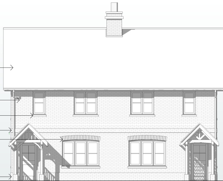
PLOTS 6-7 Front - South East Elevation

Clay Roof Tiles Brick Wall Stone Cill Brick Band Brick Arch Brick Plinth