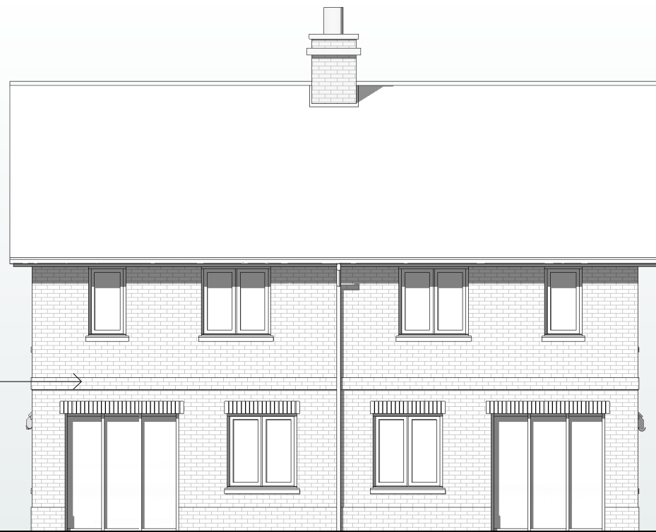
PLOT 6-7 Rear - North West Elevation