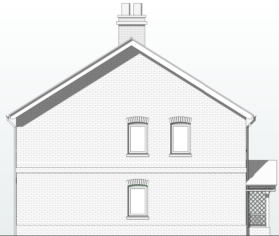
PLOT 6-7 Side - South West Elevation