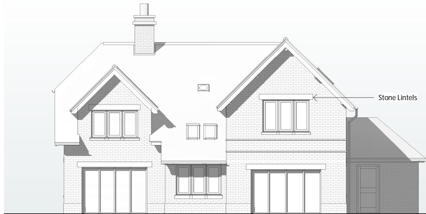
PLOT 19 Side - North East Elevation