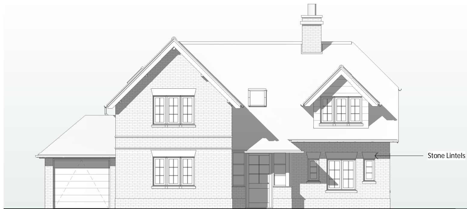
PLOT 19 Front - South West Elevation