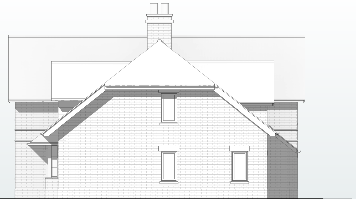
PLOT 19 Rear - South East Elevation