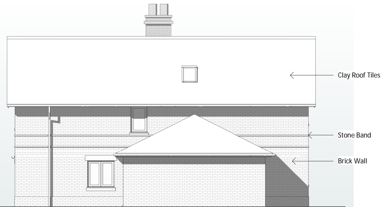
PLOT 19 Side - North West Elevation